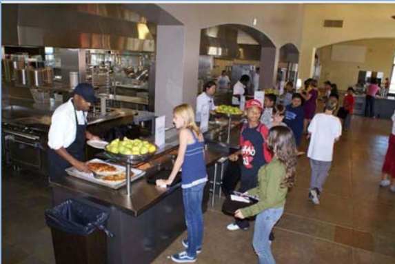
Healthy dining options in a food court setting make school lunch a healthy and inspiring part of the student day.

MLK Jr. Middle School Dining Commons Berkeley Unified School District JUBANY NAC Architecture