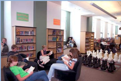
Soft comfortable furnishings make 21 st century libraries inviting places for children.

Alder Creek Middle School Tahoe Truckee Unified School District Lionakis