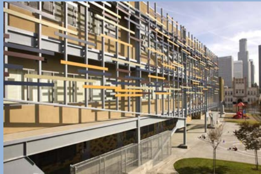
In the process of designing Gratts Primary Center and Early Education Center (Los Angeles Unified School District), many groups came together in the dense urban neighborhood just west of downtown Los Angeles to focus on the joint use of the school facility, strengthening bonds between school and community through a joint use approach.