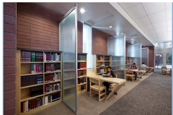
Flexible, small group and individual spaces support 21 st century learners.

Lastly, we note that in 2008, at a roundtable event sponsored by the California Department of Education, leaders in the school facilities arena noted that “any effort to encourage more innovative and flexible school design ... would likely only be minimally effective without concurrent changes to the state’s funding model.” There is some contention that the current funding model which counts classrooms ignores innovative school designs through a limited definition of “teaching station” and a mathematical formula that does not account for new distributed, online/hybrid teaching strategies. In any new bond program, attention will need to be paid to the development of the allocation formula to avoid the presumption that all students should sit in rows of desks in a square room in the 21 st century.